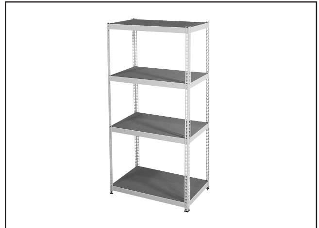
Figure 1. Model G8162.

If you need additional help with this procedure, call our service department at: (570) 546-9663.